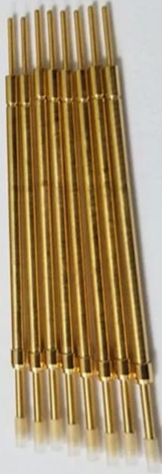
Switching test probe drawing