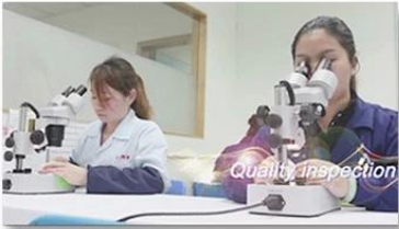
4. Quality inspection