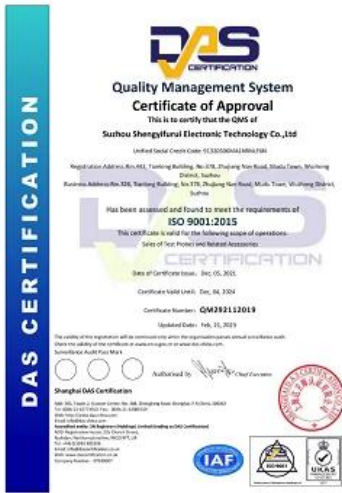
2023 ISO Certificate