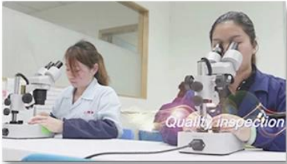
4. Quality inspection