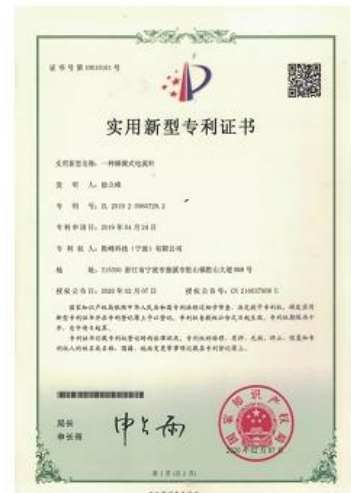
Patent for Honeycomb current probe