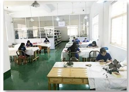
3. Assemble workshop