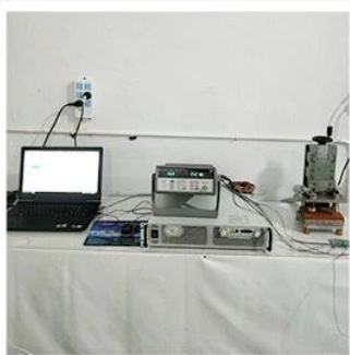
1. Agilent current testing