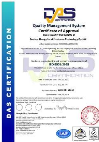
2023 ISO Certificate