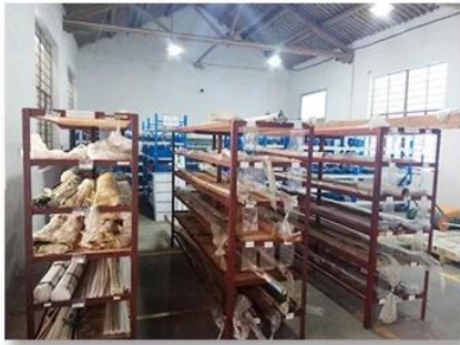
1. Raw material warehouse