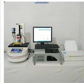
3. Load Curve Meter