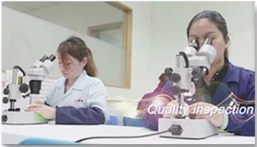
4. Quality inspection