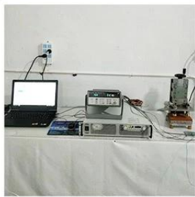
1. Agilent current testing