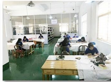
3. Assemble workshop