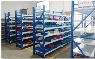
5. Finished products