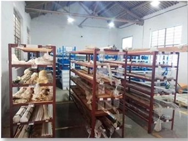
1. Raw material warehouse