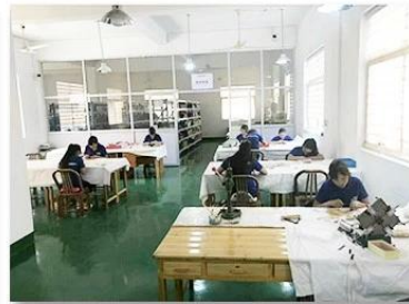
3. Assemble workshop