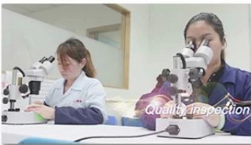
4. Quality inspection