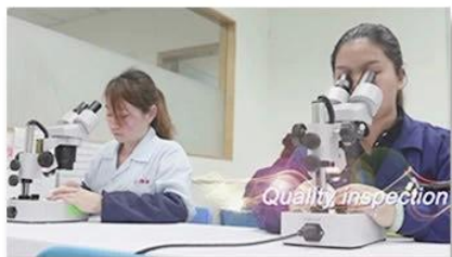
4. Quality inspection