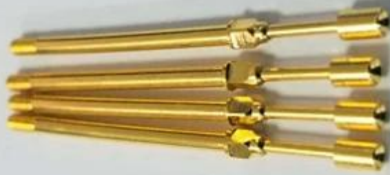
Customized probe pin drawing