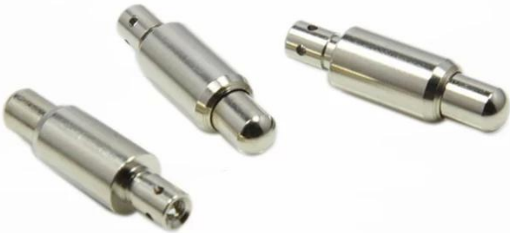
Pogo pin drawing