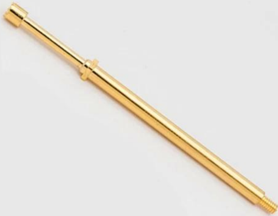
Screw test probe drawing