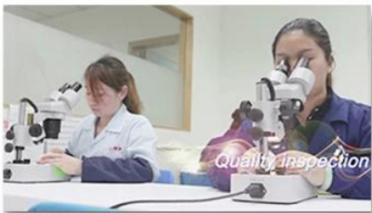
4. Quality inspection