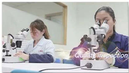
4. Quality inspection