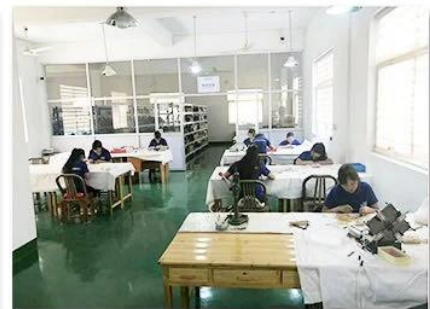
3. Assemble workshop