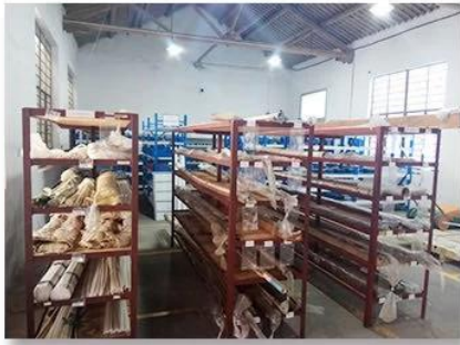
1. raw material warehouse