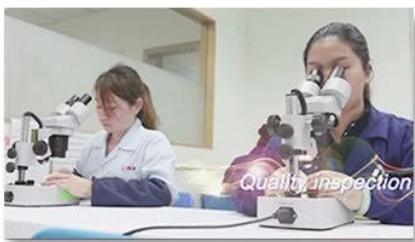
4. Quality inspection