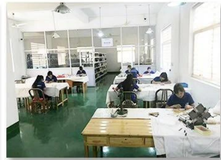
3. Assemble workshop