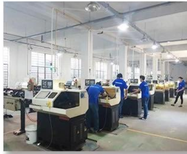
2. Lathe workshop