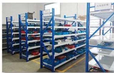
5. Finished products