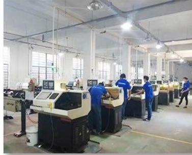
2. Lathe workshop