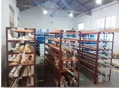
1. raw material warehouse