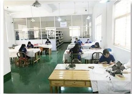
3. Assemble workshop