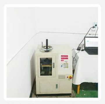
5.Life Fatigue Test