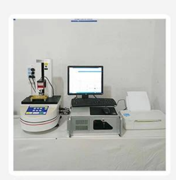
3.Load Curve Meter