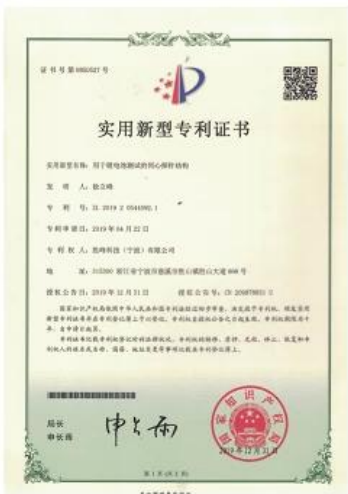
Patent for Coaxial Structure