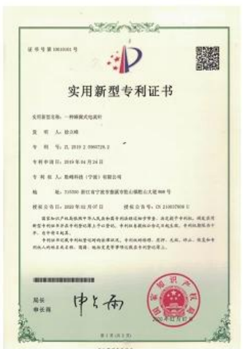
Patent for Honeycomb current probe