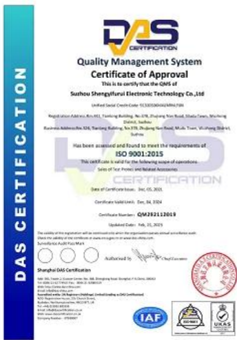
2023 ISO Certificate