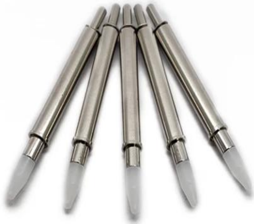
Immagine di fabbrica