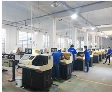
2. Lathe workshop