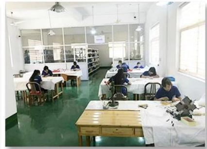
3. Assemble workshop