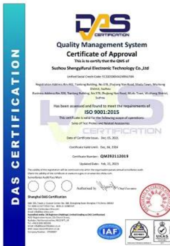
2023 ISO Certificate