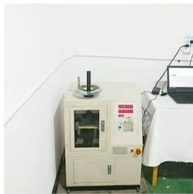
5. Life Fatigue Test