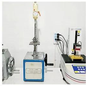
4. Bond Test