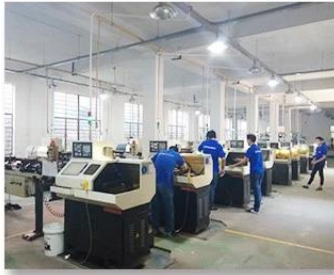
2. Lathe workshop