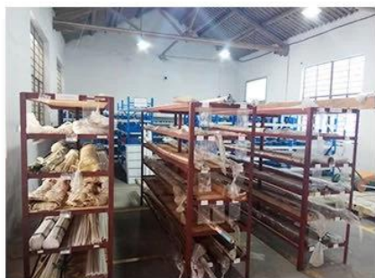
1. raw material warehouse