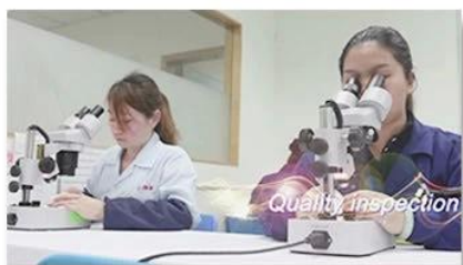
4. Quality inspection