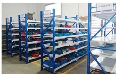
5. Finished products