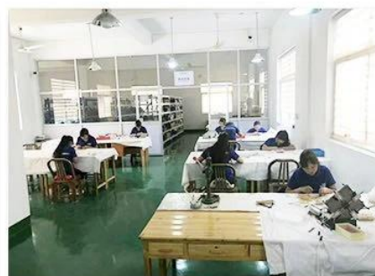
3. Assemble workshop