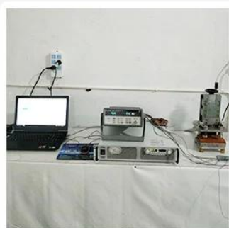
1. Agilent current testing