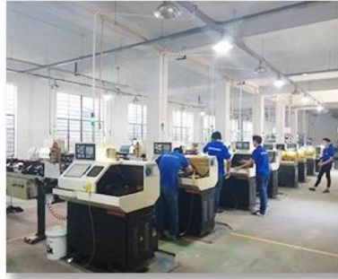
2. Lathe workshop