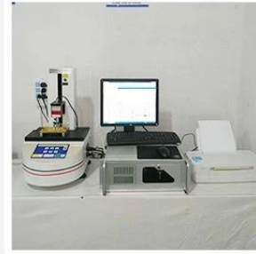
3. Load Curve Meter