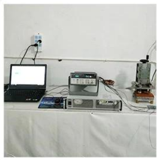
1. Agilent current testing