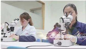
4. Quality inspection