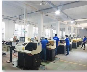
2. Lathe workshop