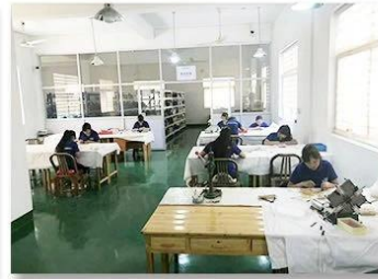
3. Assemble workshop