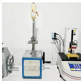
4. Bond Test