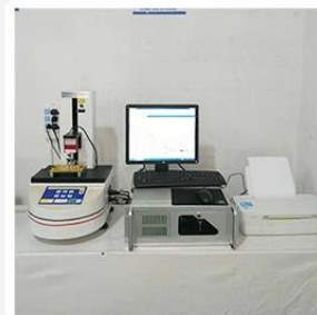
3. Load Curve Meter