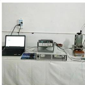
1. Agilent current testing