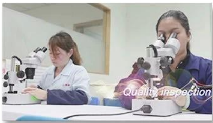
4. Quality inspection