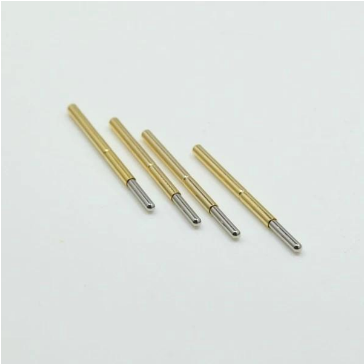
PCB test probe pin warehouse