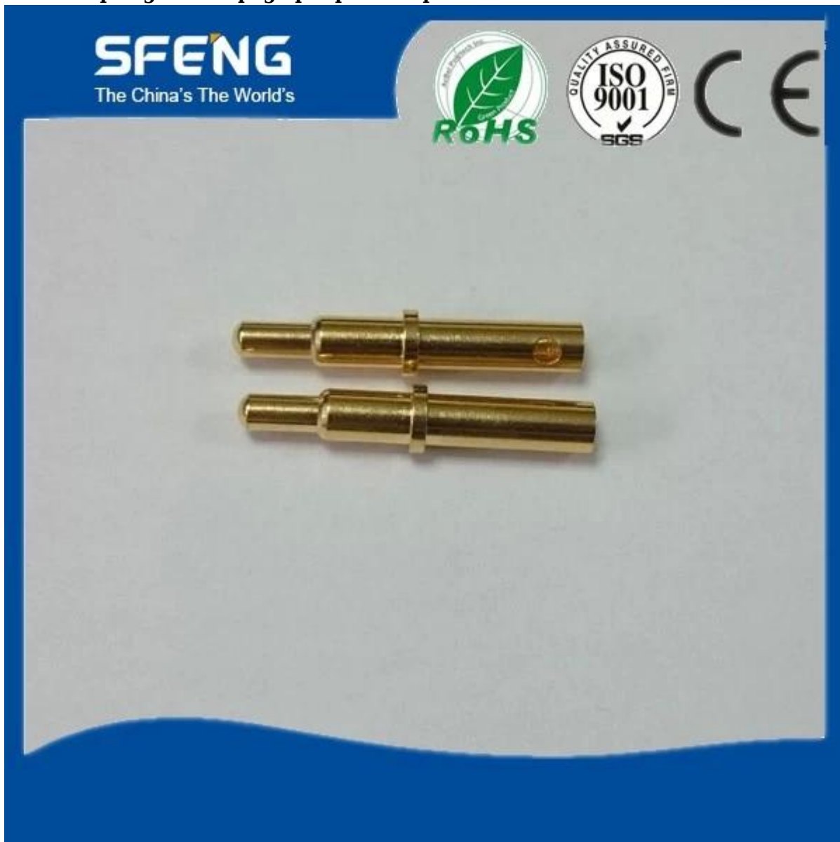
electric spring loaded pogo pin packing way