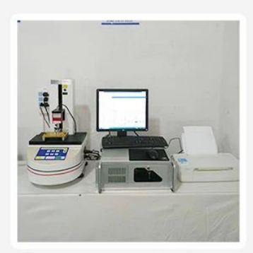
3.Load Curve Meter