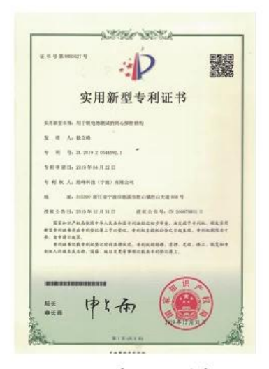
Patent for Coaxial Structure