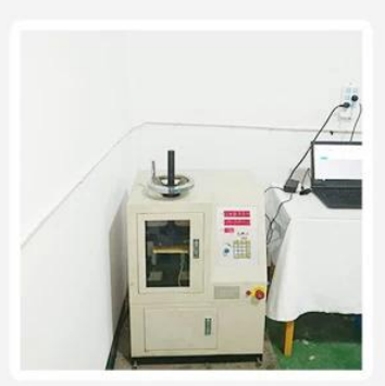
5.Life Fatigue Test