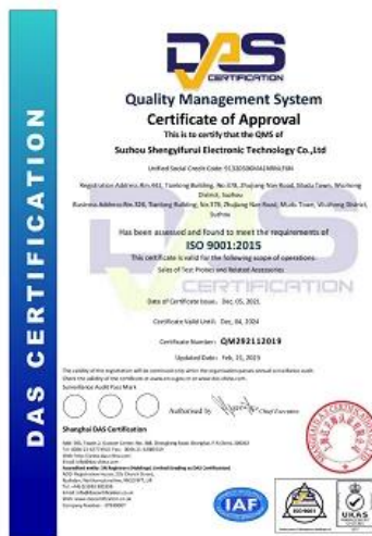
2023 ISO Certificate