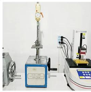
4. Bond Test