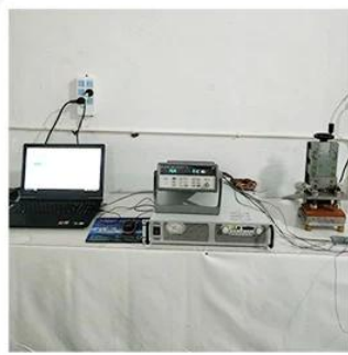
1. Agilent current testing