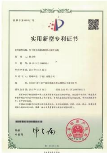
Patent for Coaxial Structure