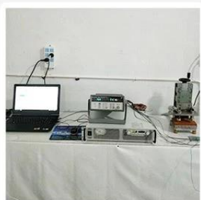
1. Agilent current testing