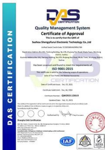
2023 ISO Certificate