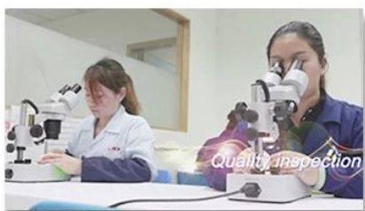
4. Quality inspection