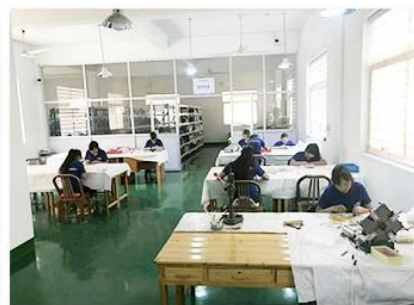
3. Assemble workshop