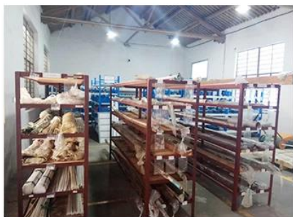
1. Raw material warehouse