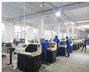
2. Lathe workshop