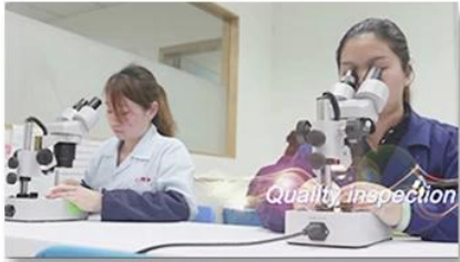
4. Quality inspection