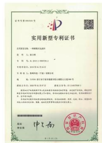
Patent for Honeycomb current probe