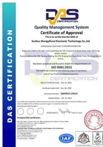
2023 ISO Certificate