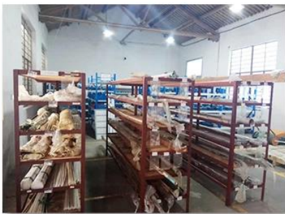
1. Raw material warehouse