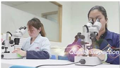
4. Quality inspection