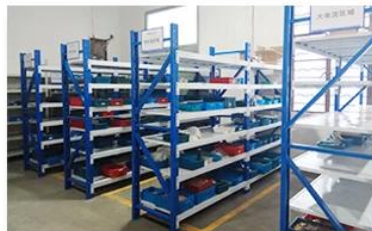
5. Finished products