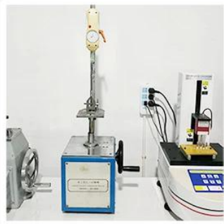
4. Bond Test