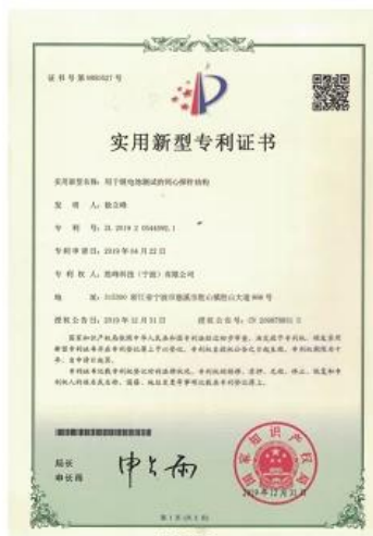
Patent for Coaxial Structure