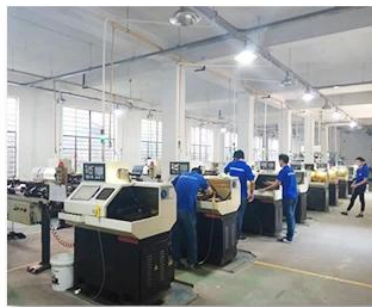
2. Lathe workshop