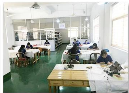
3. Assemble workshop