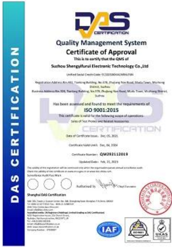
2023 ISO Certificate