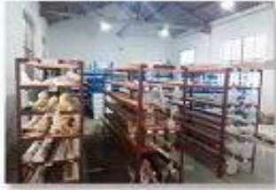
1. raw material warehouse