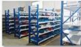
5. Finished products