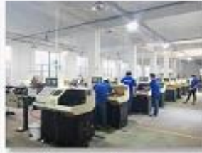
2. Lathe workshop