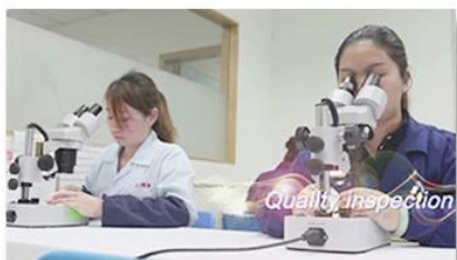
4. Quality inspection