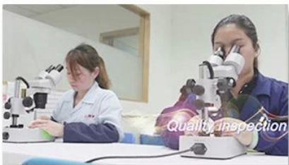
4. Quality inspection