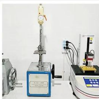
4. Bond Test