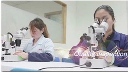
4. Quality inspection