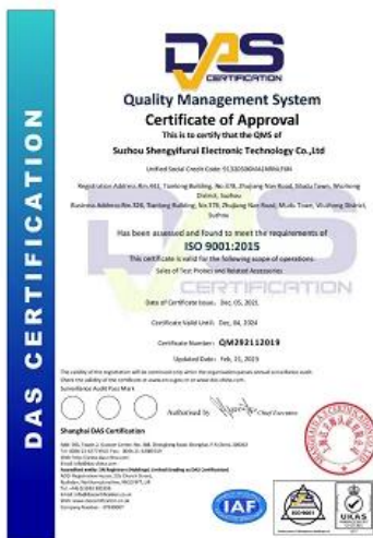
2023 ISO Certificate