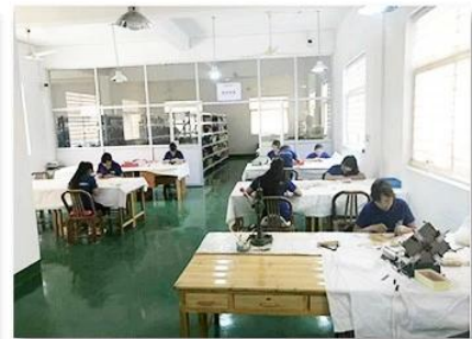
3. Assemble workshop