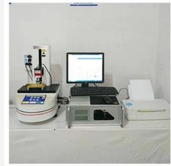
3. Load Curve Meter